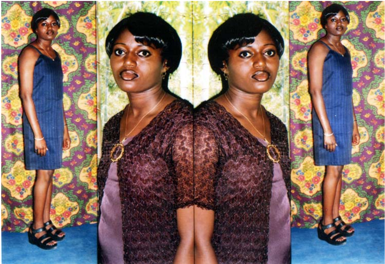
Photo: multiple exposure by Doudou Jeng, New Millenium Image Hunters , Birkama, 2000.

Friday, April 17 Mather House Lounge 5:30 pm